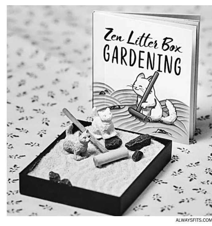
Your clumpless path to enlightenment. This week's tiny second prize, with sand, cats, rake, rocks and 32-page book.

● THE STYLE CONVERSATIONAL The Empress's weekly online column discusses each new contest and set of results. Especially if you plan to enter, check it out at wapo.st/conv1356.